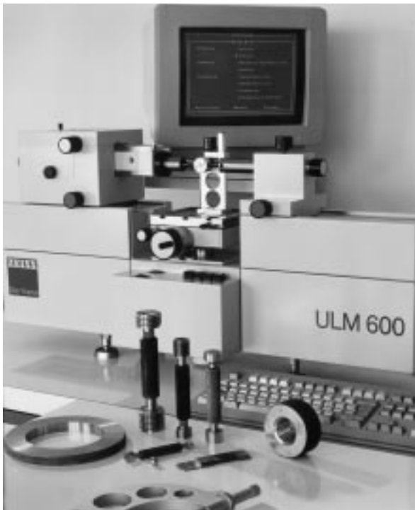
Zeiss Universal Length Measuring Machine ULM 03-600