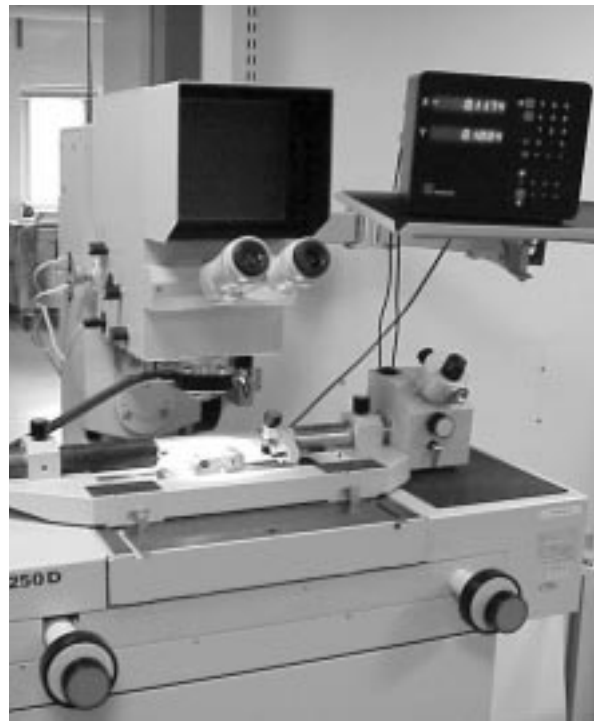
Zeiss 2 co-ordinate Measuring Machine ZKM 01-250

The quality of the products produced at Leitech has obtained great credit around the world. This is because of the extreme demands that are required from our production.